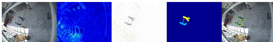
Figure 3: Sample results for object detection and tracking on the CAVIAR data. From left to right: Original frame; background variances; background subtraction; detected blobs; resulting tracked objects (outlined in green) with ground truth data in yellow.

lation, additional improvements in performance and robustness result from their adaptive probabilistic integration. The approach effectively leverages the strengths of the different cues while discounting their weaknesses.