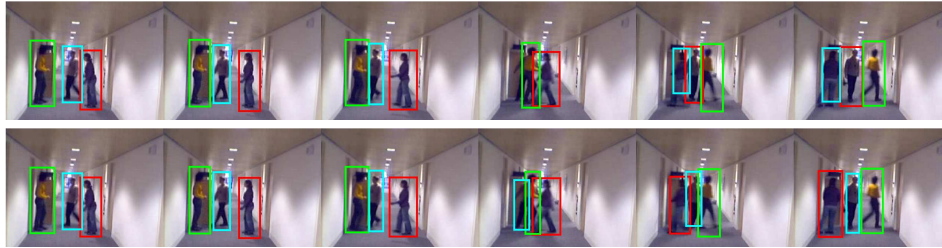
Figure 1: Indoor tracking results. Top: tracking using only blob features and distances. Bottom: tracking using the robust fusion of adaptive appearance models as described above. Note how this allows identity of tracked entities (indicated by bounding box colour) to be maintained during and across occlusions.